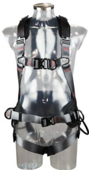
Work positioning D-ring